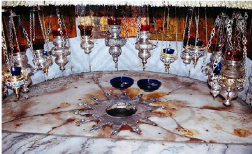
SHRINE MARKING THE SPOT OF THE MANGER IN BETHLEHEM

To the Christ-loving Priests, Deacons, Monastics and Lay Folk of this God-protected Diocese: