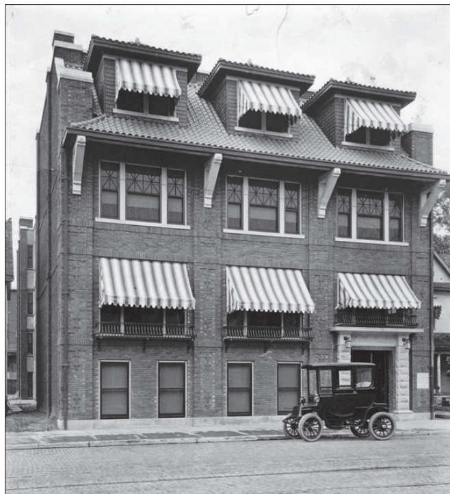
The early YWCA building at 140 N. Topeka, where a “Syrian dinner” was held in 1933.