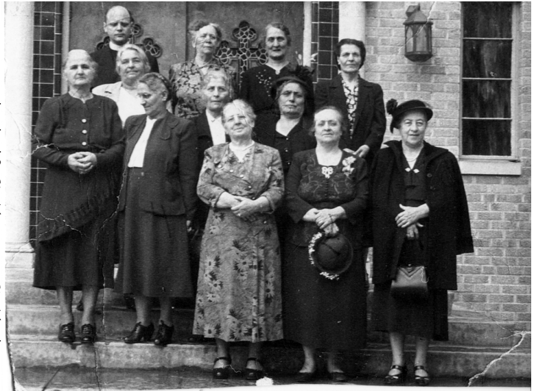
Matriarchs of St. George on the steps of the new St. George Church in 1950. Proceeds from their Syrian dinners helped pay for the church.

“I cut all the parts into pieces and give it to the ladies so they could cut it up and get it ready [to cook]. I had to skin it, because none of them would dare touch those big knives!”