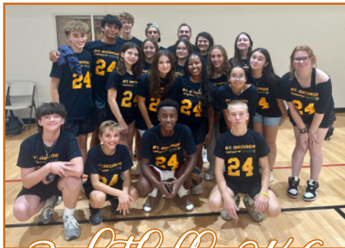
Basketball - OKC