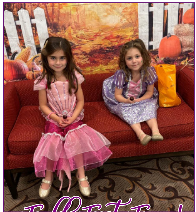
Fall Fest Fun!